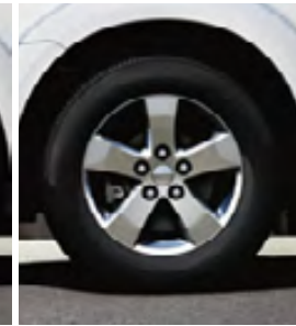
17-inch aluminum (optional on AVP and SE)