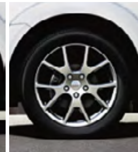
19-inch Satin Silver aluminum (standard on Crew; optional on SXT)